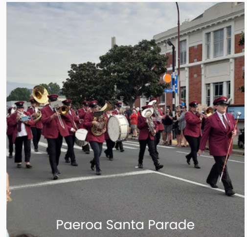
Paeroa Santa Parade