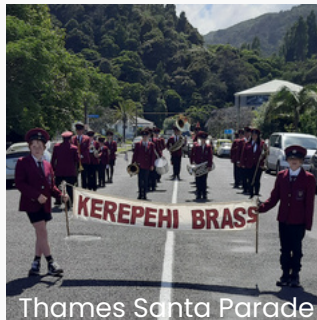
Thames Santa Parade