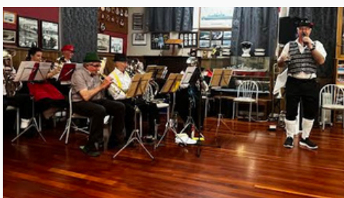
Bavarian Nights – Paeroa & Thames