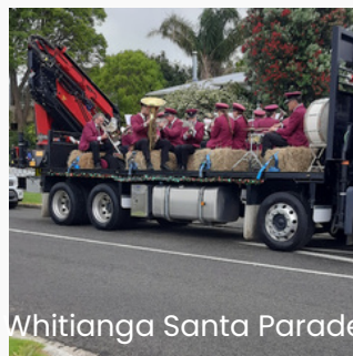
Whitianga Santa Parade