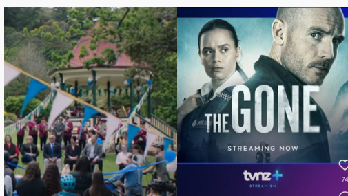
Filming on 'The Gone' – Te Aroha