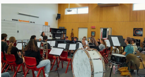
Hosting WBOPBBA Youth Day