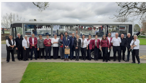
Bus Trip to Regionals – Cambridge