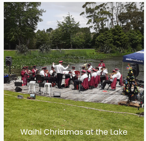
Waihi Christmas at the Lake