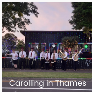
Carolling in Thames