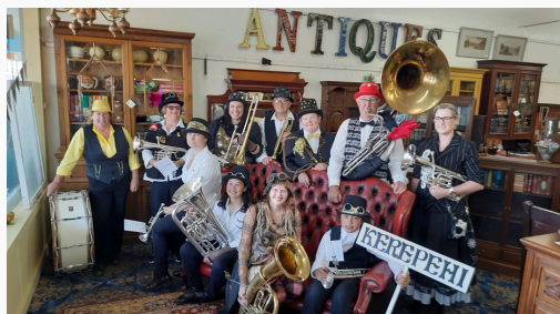
Steampunk – Thames